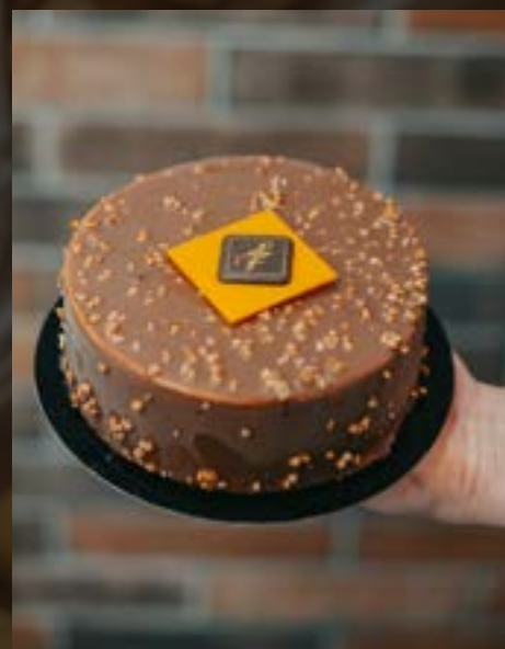
Chocolate Caramel Cake (serves 6-8)