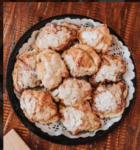
Mini Almond Croissants (platter of 10)