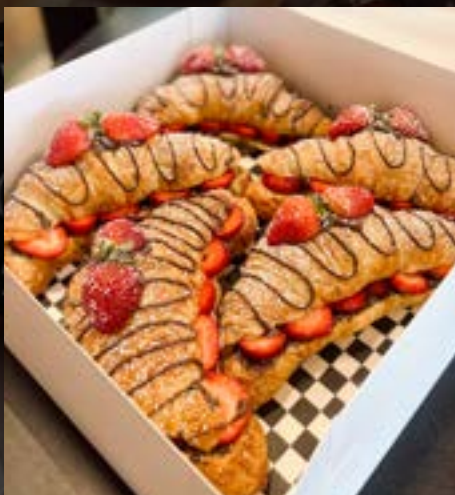
Nutella & Strawberry Croissant (box of 5)