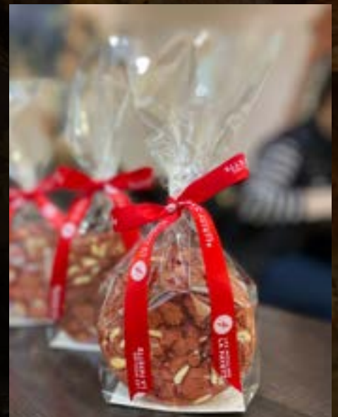
Red Velvet Cookies (custom bags of 3)