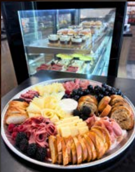
Charcuterie Platter (serves 20)