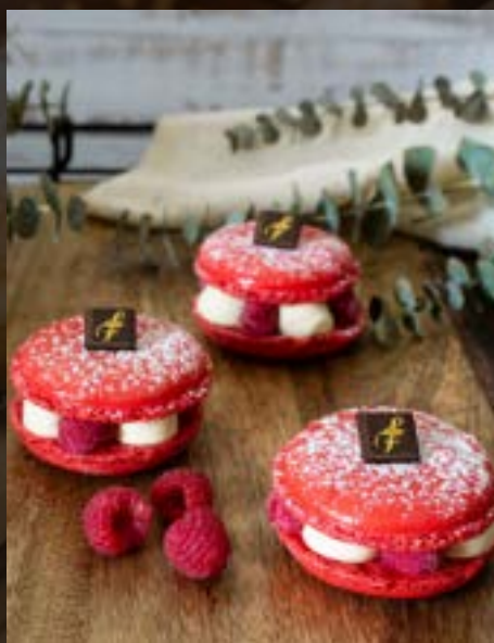
Raspberry Macaron (seasonal product)