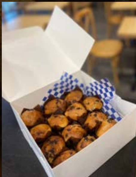
Mini Pear & Chocolate Muffins (box of 13)