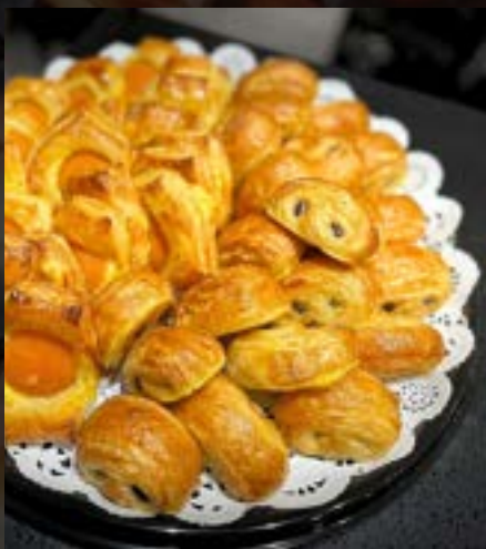
Mini Apricot Delight & Chocolatine Pastries (platter of 40)

All pastries are served in white boxes. Upgrade your packaging to plastic platters for $4/platter.