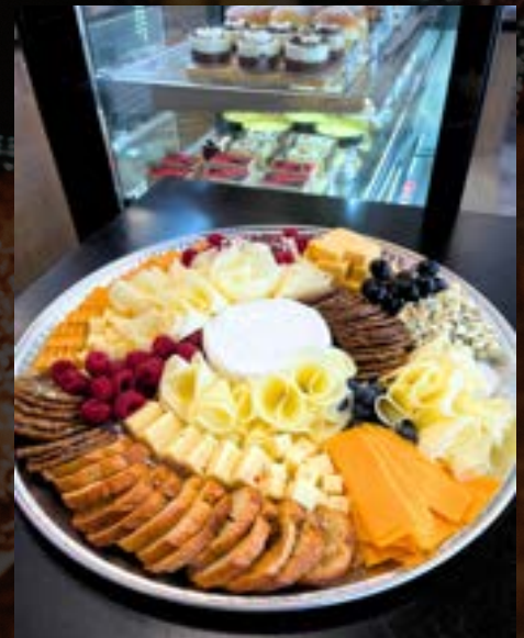
Cheese Platter (serves 20)