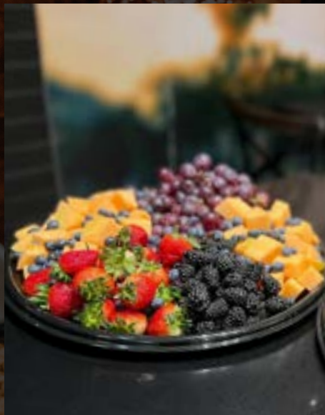
Large Fruit Platter (serves 20)