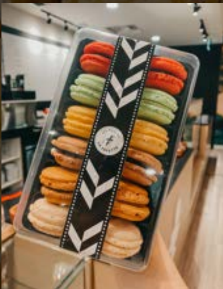
Assorted Macarons (box of 24)